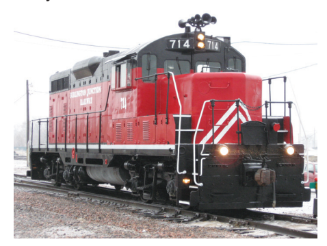
The boom in the oil industry means higher car volumes for the Burlington Junction Railway.

for energy companies," Wingate said. "We help even out flow so trains don't arrive in North Dakota the same day. When things get backed up, they use our yard to hold the trains."