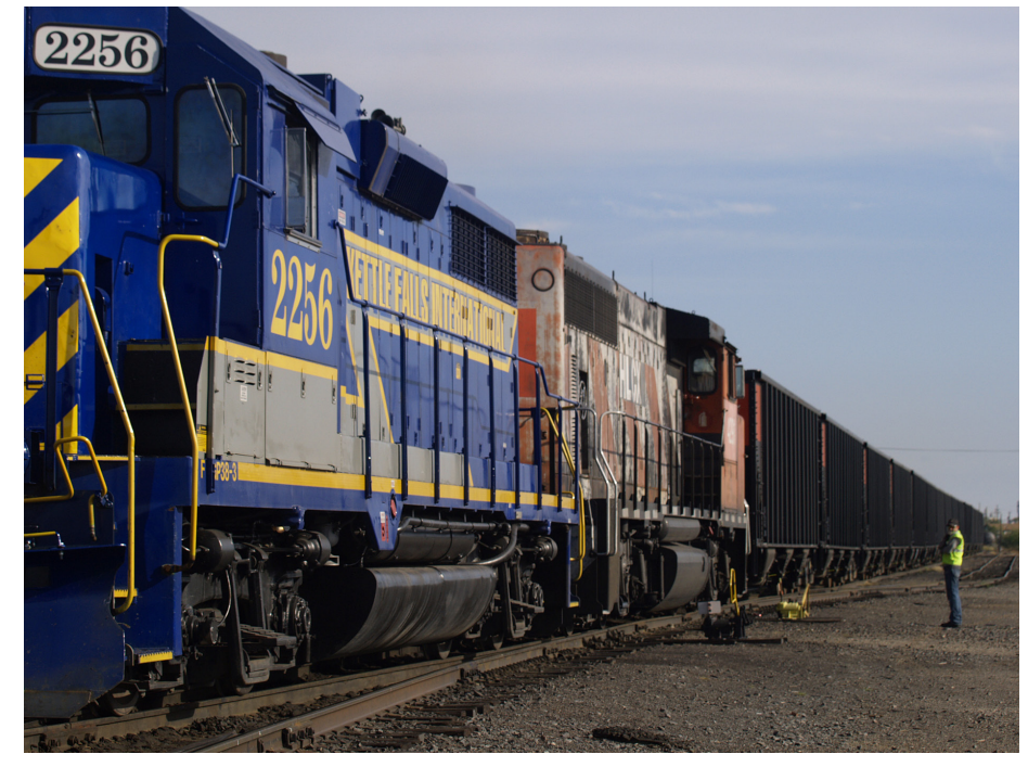
A collaborative effort with BNSF has enabled the Kettle Falls International Railway to become an attractive place for growth.

KFR is already seeing results. During the last six months, KFR improved speeds along its lines between the BNSF interchange